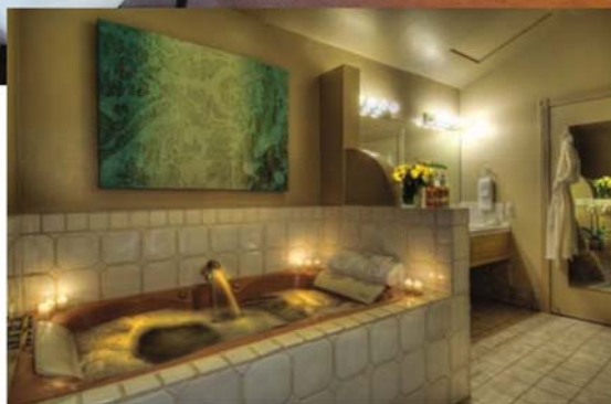
Lake La Quinta Inn, above and opposite, has 13 just-updated, luxurious rooms and suites complete with in-room mini bars stocked with wine, champagne and hard liquor, fireplaces and Jacuzzi tubs.